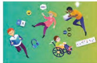
Languages, Literacy & Communication