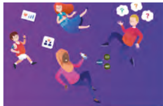
Health & Wellbeing