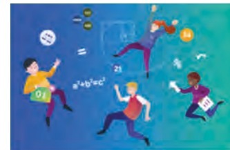
Mathematics & Numeracy