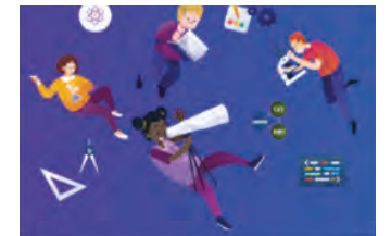
Science & Technology